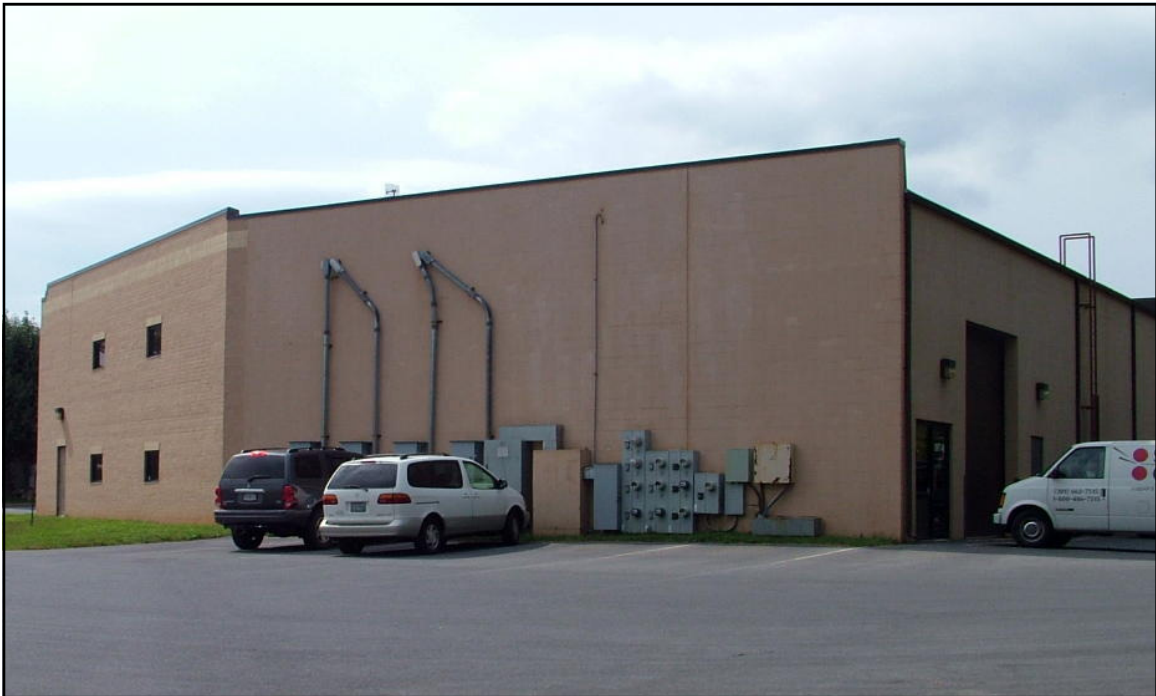
Side of Building

Disclaimer: Information obtained from sources deemed to be reliable. However, we make no guarantee, warranty or representation. Information, prices, and other data may change without notice.